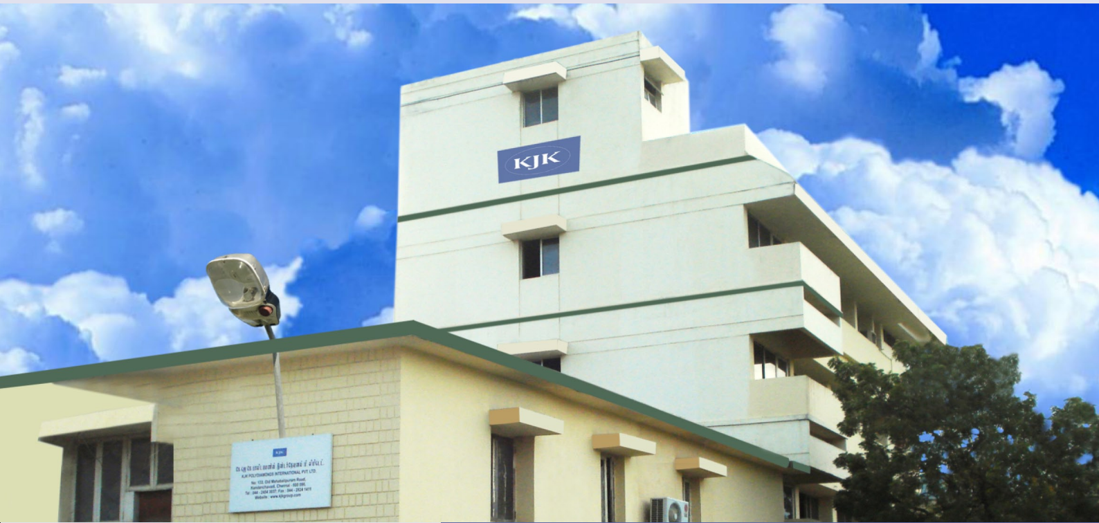
Our Hi-tech factory located at Chennai ▲