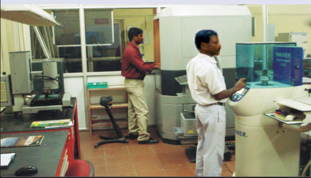
CNC Measurement Line ▼