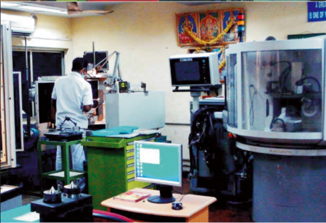
Automated Production Lines ▲